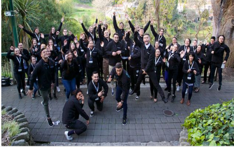
Nga Whetu Hei Whai Alumni 2015