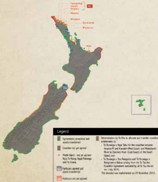
Allocation of Harbour Entitlements at 30 September 2014