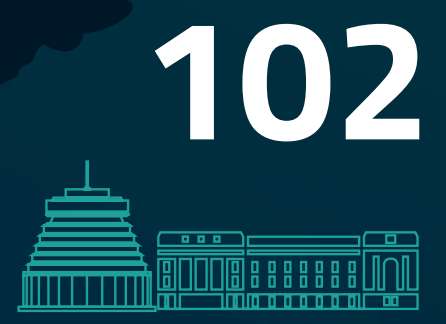
Hui with Crown agencies

28N Rights, Trans Tasman Resources & Tarakihi